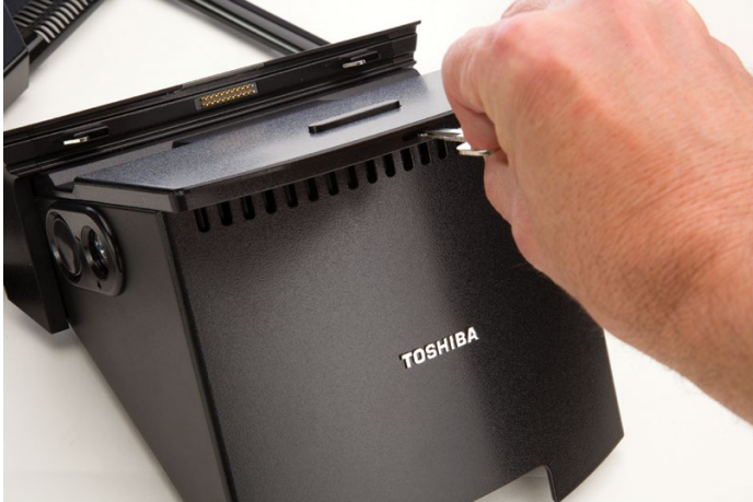
■ Shown: Back cover removal