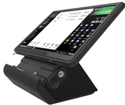
Shown: TCxFlight Separation

Mobile devices are of limited value unless they are available anytime, and every time they are required. TCxFlight is reconfigurable on demand with the simple push of a button. Shown below, the mobile unit can be locked and docked right where it is used in any number of primary traditional roles when combined with the optional Dock feature.