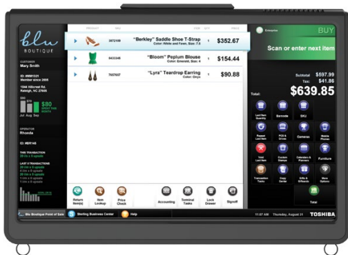
Shown: Mobile unit with no base (front)

The TCxFlight enables traditional or mobile solutions for today's retailers with the power and performance packaged in a rugged design.