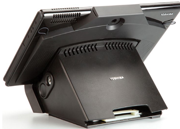
■ Shown: Back view of TCxFlight with base