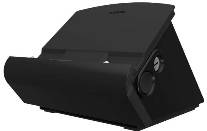
Shown: Base only (front)