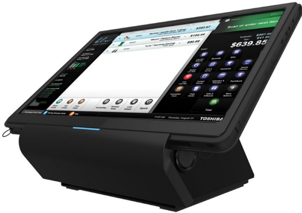
Shown: TCxFlight Point of Commerce Solution with Dock

Toshiba TCxFlight is a traditional solution to today's core retail requirements. With its elegant industrial design, TCxFlight offers an extension of the Toshiba Global Commerce Solutions portfolio and provides retailers a consistent look and feel across their store.